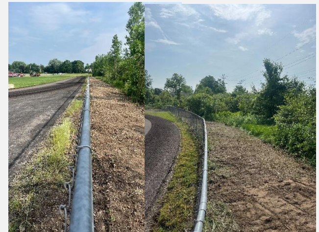
Waldon Middle School Track Clearing