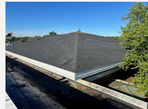
Asphalt roofing work at front office finalized