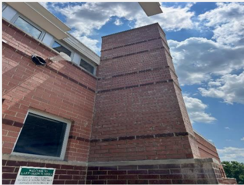
Masonry brick replacements complete for flagpole wall

The Lake Orion Community Schools Oakview Middle School is an interior and exterior renovation project of the 125,649 square foot building. The project consists of new flooring and paint in existing classrooms, roofing replacements, new glass breakout rooms in the existing media center, and room revisions to the adjacent media center offices and maker space. The building will also receive new boilers, hydronic system pumps, lighting controls, and temperature controls on the existing to remain equipment. The site work consists of new concrete drive approaches, various concrete repairs, asphalt repairs/replacements, and new track asphalt surfacing and striping. The building is located on the east side Lake George Road just north of Stoney Creek Road.