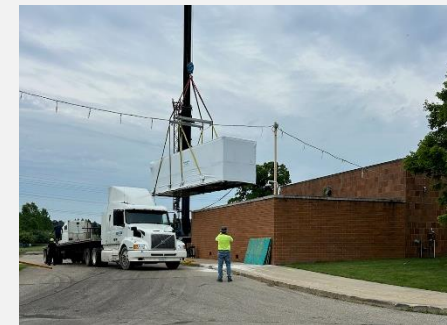
Crane placing new chiller within brick enclosure