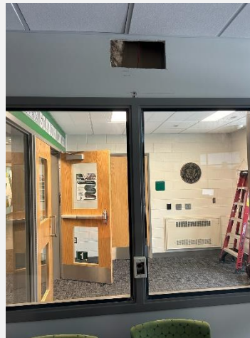
Stadium Drive Elementary Pull Station Relocation