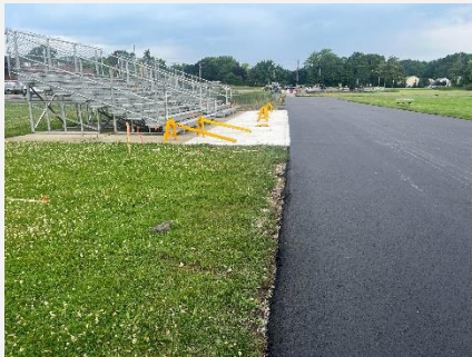
New track asphalt and concrete at track

The Lake Orion Community Schools Waldon Middle School is an interior and exterior renovation project of the 98,450 square foot building. The project consists of new flooring and paint in existing classrooms, roofing replacements, new skylight and ceiling system in the existing media center, and room floor plan revisions to the adjacent media center offices. The building will also receive new boilers, a new chiller, two new air handling units, and upgrades to the overall building heating and cooling hydronic systems, and temperature controls on the existing to remain equipment. The site work consists of a new concrete drive west approach, new west lot asphalt parking section, various asphalt and concrete repairs throughout the site, and new track asphalt surfacing. The building is located on the south side of Waldon Road just west of Joslyn Road.