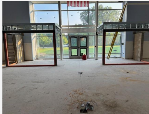
Media center breakout room framing complete