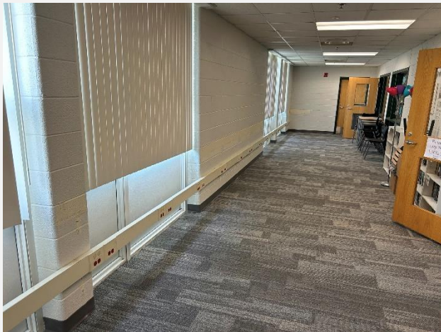
Scripps Middle School Countertop Demolition