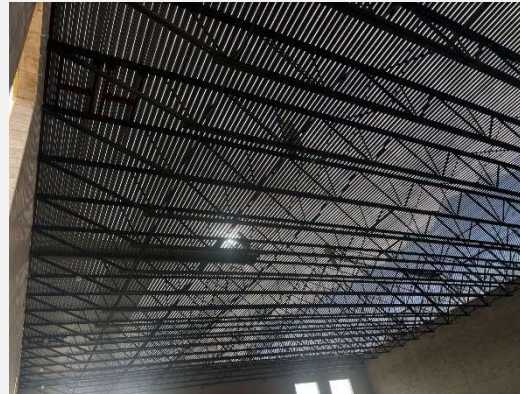
Structural Steel and Roofing, complete.