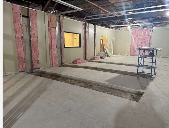
Sawcut for underground electrical complete. Rough-in will take place in August.