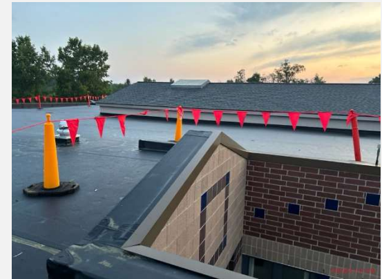
Roofing and shingle replacement in progress.