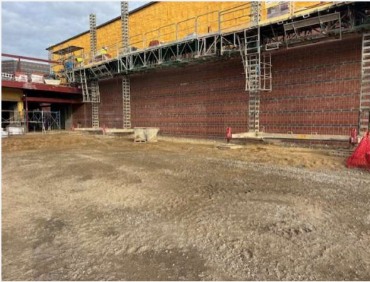
Spray foam and brick installation in progress