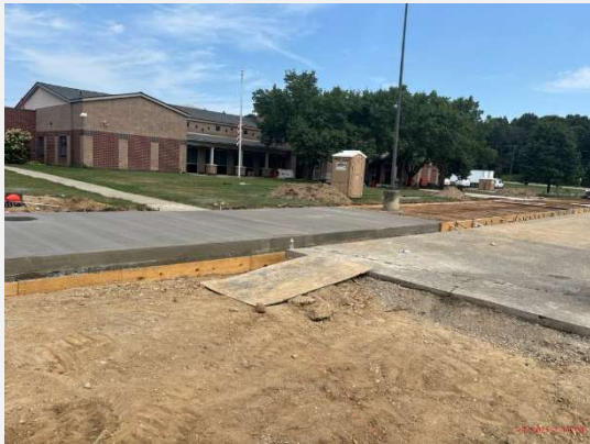
Sidewalk installation in progress.

The Lake Orion Community Schools Paint Creek Elementary Site & Building Improvements project includes two new additions to the school, along with interior renovations and mechanical upgrades. The first addition is a 2,474-square-foot space designated for classrooms and activities, while the second is a 789-square-foot expansion of the gymnasium for storage. Interior renovations will feature new flooring, fresh paint, and multiple mechanical upgrades. Site improvements include replacing a portion of the pavement, adding ADA-accessible parking spaces in the west lot, installing new concrete sidewalks, and enhancing landscaping.