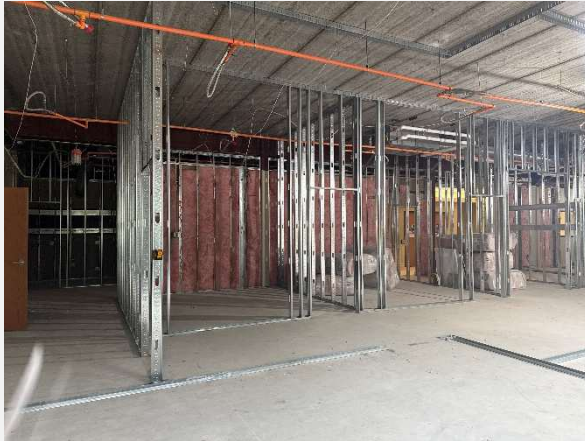
Wall framing on lower level in progress.

The LOCS Administration Building Renovation Project involves the interior renovation of the existing “Orion Center.” The facility will be transformed into multiple offices and conference spaces to support LOCS administrative functions. On the upper level, new paint and flooring will be installed in a few areas and offices will be reconfigured to better align with LOCS operational needs. The lower level will undergo a complete reconfiguration converting the existing layout into a series of new offices and workspaces. Mechanical, electrical, and plumbing (MEP) upgrades will be incorporated to support the revised floor plan, and new finishes will be applied throughout lower level.