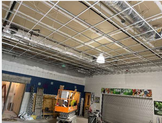
Ceiling grid installation complete.