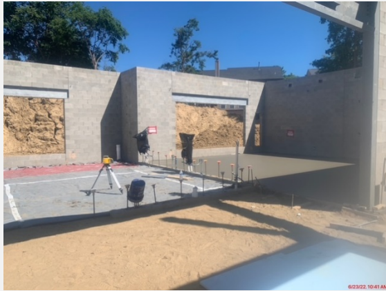
Concrete Flatwork Area D

Lake Orion Community Schools New Blanche Sims Elementary is a new ground up 68,875 square foot building. The building consists of 19 new classrooms, a secure entry and office spaces, and extended learning spaces within the building. The facility also includes a new kitchen with server, cafeteria with stage, gymnasium, STEM and Media Center. The site work includes new playground equipment, soccer field and a new larger parking lot and a bus & parent drop off loop. The new school sits on the site to the north of the existing Blanche Sims Elementary.