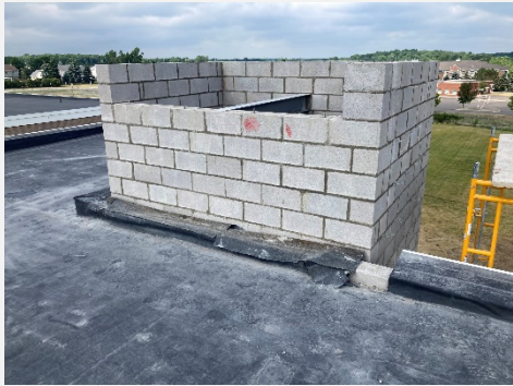
Topped out elevator shaft

Lake Orion Community Schools Scripps Middle School is a renovation, addition and site work project. The scope includes a new office addition that will include a new secure entry, and a separate addition for the new elevator. The interior renovation includes finish work, a new mechanical system including new unit ventilators in each classroom, and electrical upgrades. The project also includes site work associated with the new office addition.