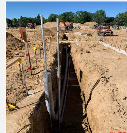
Plumbing and Electrical Underground