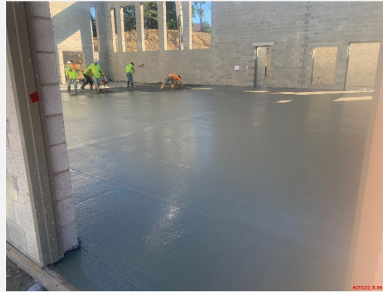
Concrete Flatwork in Gym