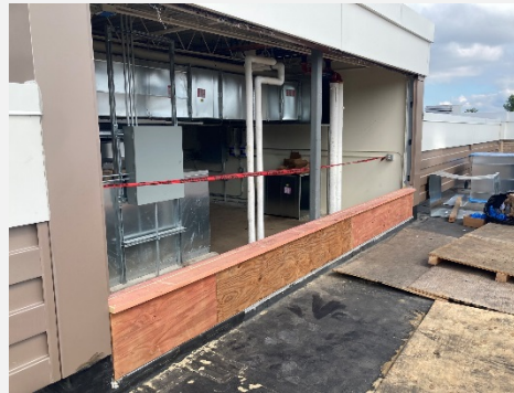
Mechanical unit above Media Center