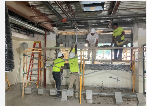
New Makers Space