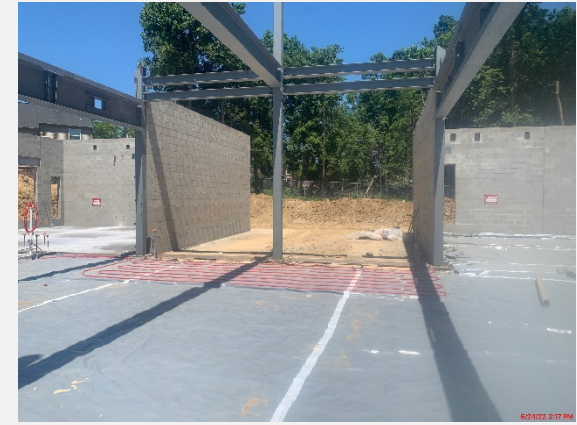
Structural Bearing Area D