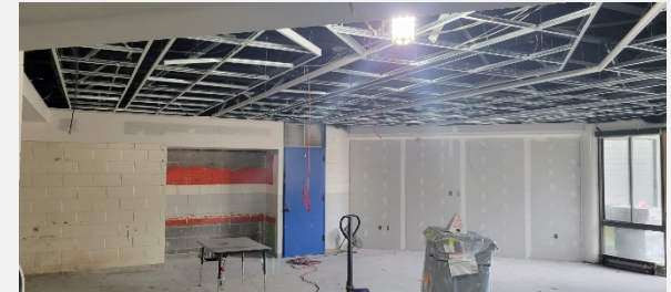
Cloud Ceiling Framing in STEM