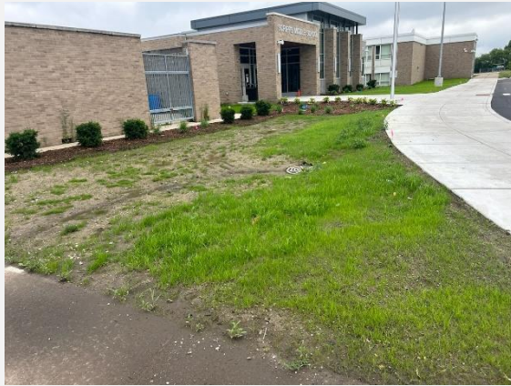
New Addition Landscaping

Lake Orion Community Schools Scripps Middle School is a renovation, addition and site work project. The scope includes a new office addition that will include a new secure entry, and a separate addition for the new elevator. The interior renovation includes finish work, a new mechanical system including new unit ventilators in each classroom, and electrical upgrades. The project also includes site work associated with the new office addition.