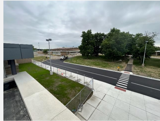
Finalization of Asphalt and Striping