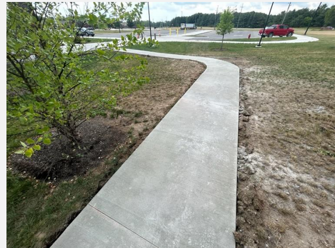
LO Early Childhood Center – New Concrete Walkway