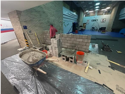
Pine Tree Center – Half Height Masonry Wall Install

Lake Orion Community Schools 2023 Secure Entries is an upgrade to Waldon Middle School's, Oakview Middle School's, and Pine Tree Center's existing front entry and office spaces. The existing spaces will be modified with new architectural and security features such as magnetic/electronic locking hardware for lockdowns, added windows for better visibility, and revised room layouts. There will be updated finishes to include new flooring, aluminum building signage, and built-in reception desks. Additionally, the mechanical equipment in these spaces will be updated with new, modern equipment and temperature controls.