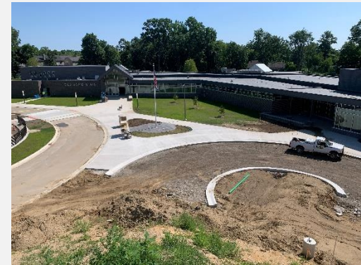
Site Concrete and Landscape Install