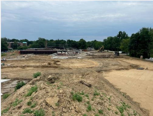
Demolition of Existing Blanche Sims Continues

Lake Orion Community Schools New Blanche Sims Elementary is a new ground up 68,875 square foot building. The building consists of 19 new classrooms, a secure entry and office spaces, and extended learning spaces within the building. The facility also includes a new kitchen with server, cafeteria with stage, gymnasium, STEM and Media Center. The site work includes new playground equipment, soccer field and a new larger parking lot and a bus & parent drop off loop. The new school sits on the site to the north of the existing Blanche Sims Elementary.