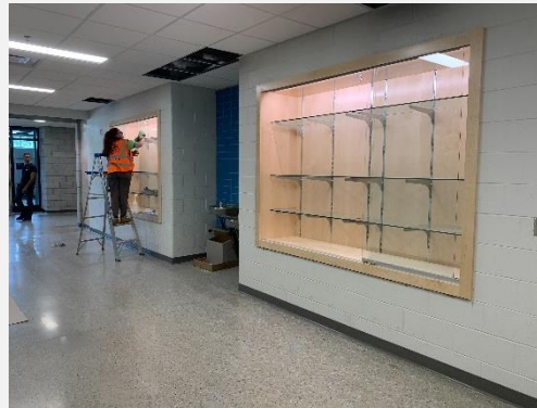
Final Touch-ups, Cleaning of Trophy Cases