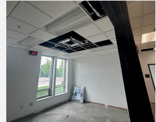
Oakview – Installed Fan Coil Unit