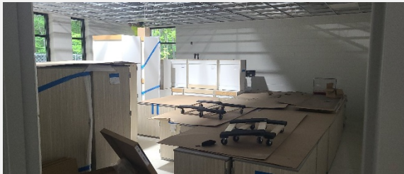
Millwork & Cabinet Delivery

Lake Orion Community Schools Webber Elementary is a 2-phase project with both interior and exterior renovations. Exterior renovations consist of demolition of the existing classroom wing and building a brand new 26,024 square foot addition with 13 classrooms, 2 extended learning areas and a new media center. Also included is a complete redesign of the existing parking lot and adding a bus loop on the east side of the building with additional staff parking. Interior renovations consist of a new secure entrance, and new front offices, moving the existing teachers lounge to the center of the building, and revising interior classrooms. Work also includes upgrading HVAC, technology, and some electrical services throughout the building.