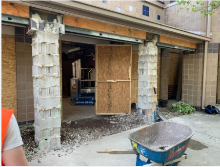
Exterior Soffit Demo

Lake Orion Community Schools Paint Creek Elementary is an interior renovation. The bulk of this work is to update the secure entry, and a office renovation. The new office will be getting mechanical, electrical, plumbing and architectural upgrades, with a new reception desk. Paint Creek will also be receiving all new exterior aluminum doors, and a new entry soffit upgrade. Along with electrical upgrades in each classroom for new interactive panel teaching devices.