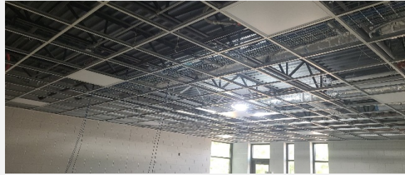
ACT Grid Installation