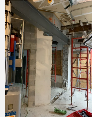
New Steel Beam