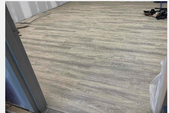
New Flooring Work Continues