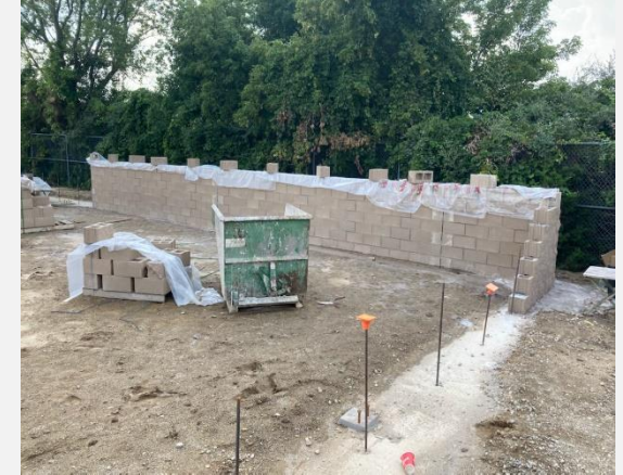
4' Coursing of Block and Concrete Being Installed