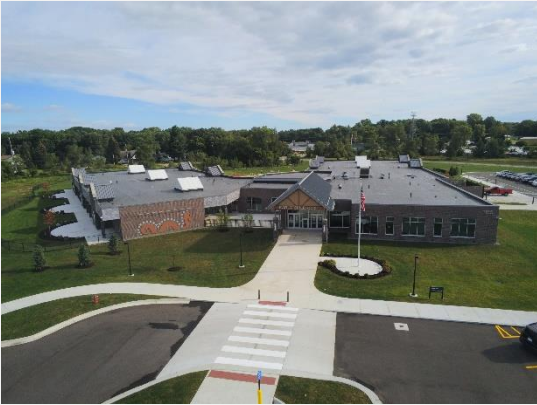
Site Restoration and Finishing Touches

Lake Orion Community Schools New Early Childhood Center is a new ground up 48,900 square foot building. The building consists of 18 new classrooms with private toilet rooms, a secure entry and office spaces, extended learning spaces within the building and outdoor learning spaces adjacent to each classroom. The facility also includes a new kitchen and a large gross motor development space. The project sits on the site adjacent to Orion Oaks and provides a new driveway connection to Clarkston Road.