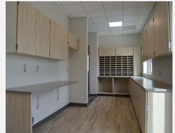
Millwork and Casework Nearing Completion