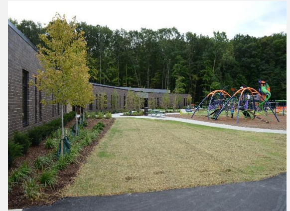
Site Landscaping at New Addition