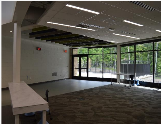
Ceiling Systems Finished and Furniture Delivered