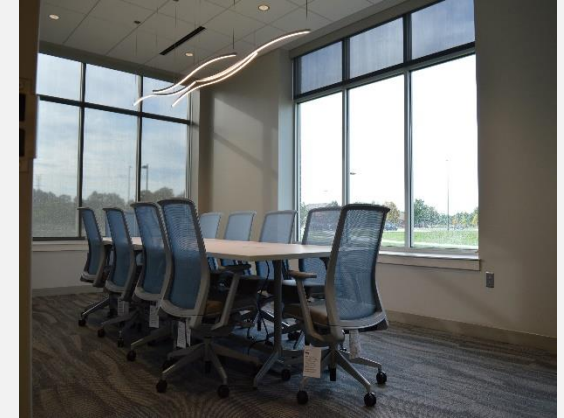
New Office Furniture and Lighting