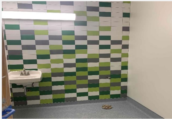
Bathroom Tile and Fixtures Being Installed

Lake Orion Community Schools Paint Creek Elementary is a 6,609 square foot interior renovation. The bulk of this work is to update the secure entry, and a office renovation. The new office will be getting mechanical, electrical, plumbing and architectural upgrades, with a new reception desk. Paint Creek will also be receiving all new exterior aluminum doors, and a new entry soffit upgrade and electrical upgrades in each classroom for new interactive panel teaching devices.