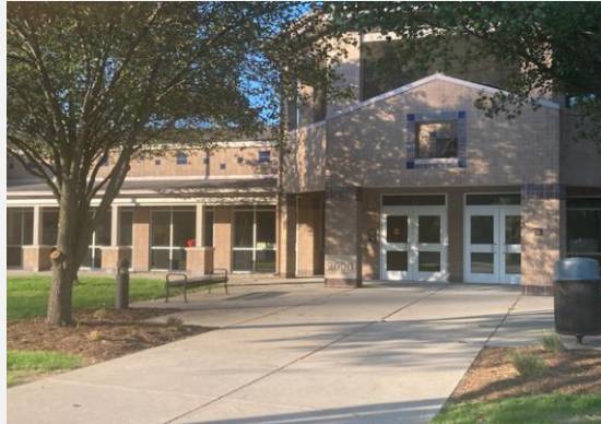
New Front Office Entryway Complete