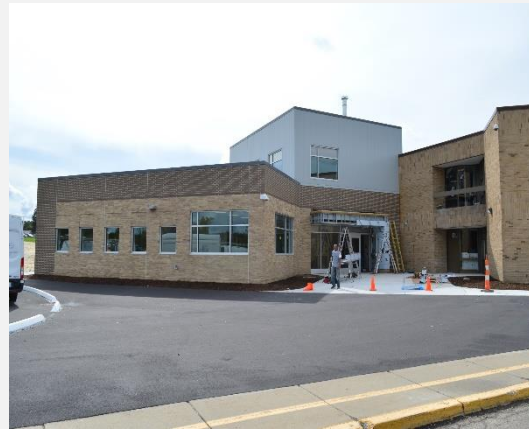
Brick Veneer and Asphalt Lot Completed