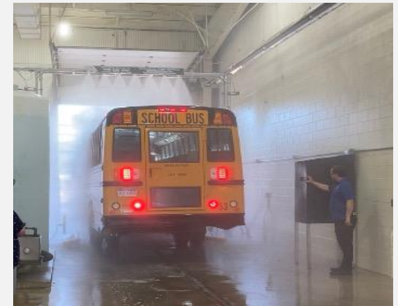
New Bus Wash System in Use