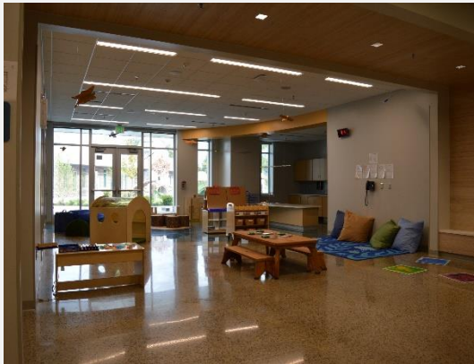
Extended Learning Area Fully Furnished