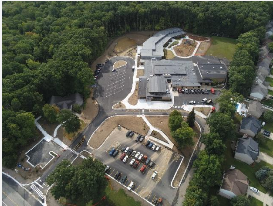
Site Asphalt Work Nears Completion

Lake Orion Community Schools Webber Elementary is a 2-phase project with both interior and exterior renovations. Exterior renovations consist of demolition of the existing classroom wing and building a brand new 26,024 square foot addition with 13 classrooms, 2 extended learning areas and a new media center. Also included is a complete redesign of the existing parking lot and adding a bus loop on the east side of the building with additional staff parking. Interior renovations consist of a new secure entrance, and new front offices, moving the existing teachers lounge to the center of the building, and revising interior classrooms. Work also includes upgrading HVAC, technology, and some electrical services throughout the building.