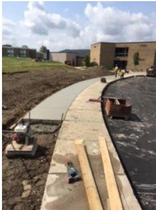
Stadium Drive Elementary- Sidewalk Extension