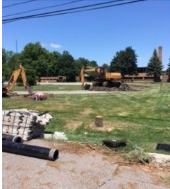
Site demolition at Blanche Sims Elementary.