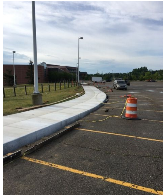
Sidewalk Replacements at Lake Orion High School..