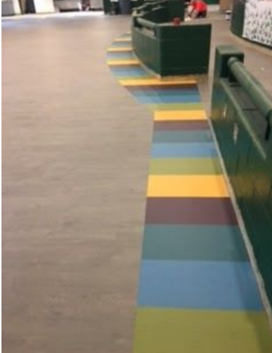
Orion Oaks cafeteria flooring replacement