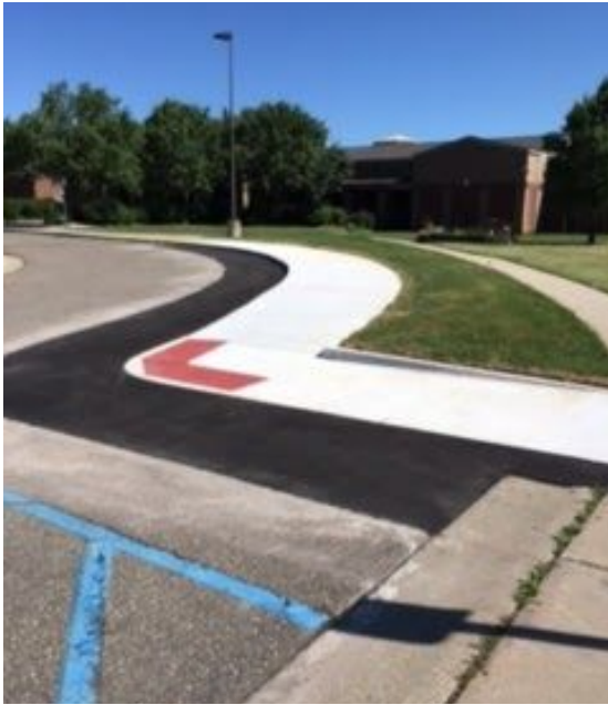
Parent Drop off sidewalk extension Paint Creek.