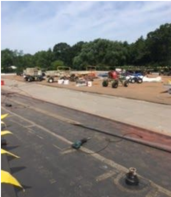
Roof Replacement at Carpenter Elementary.