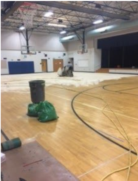
Paint Creek Elementary - Gym floor renovation