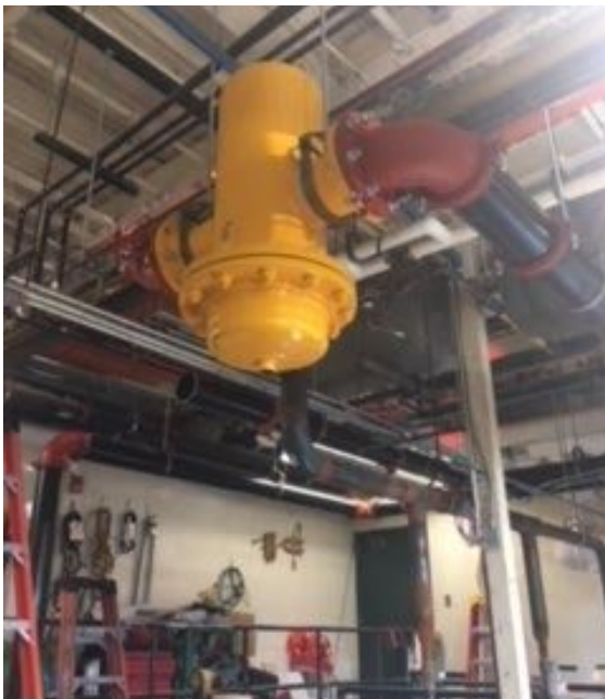
Scripps Middle School- Air and Dirt Separator.