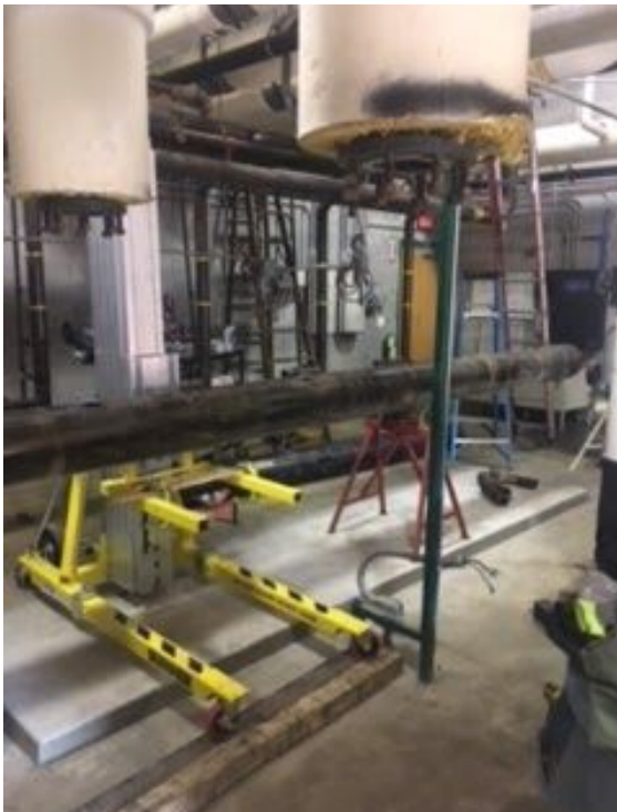
High School- New Mechanical Piping installation