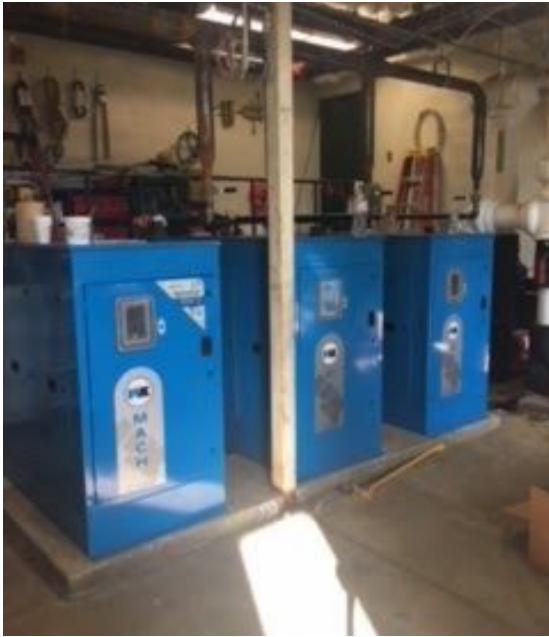
Scripps Middle School- Boiler Replacement