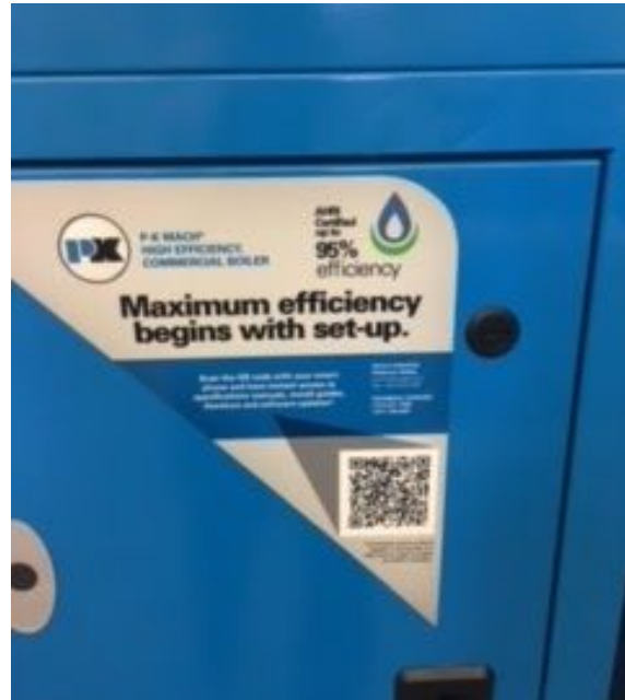
High School, Scripps and Orion Oaks- New P-K Mach 95% Efficiency Boilers