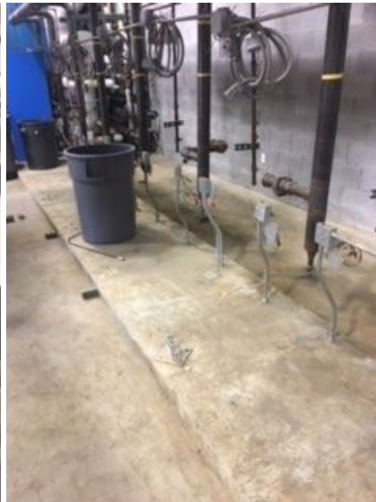
High School- Preparation for New Boilers