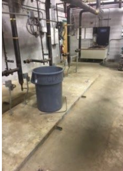
High School - Demo of Boilers