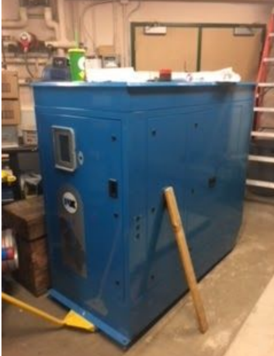
Orion Oaks- 1 of 2 New Boilers ready for placement