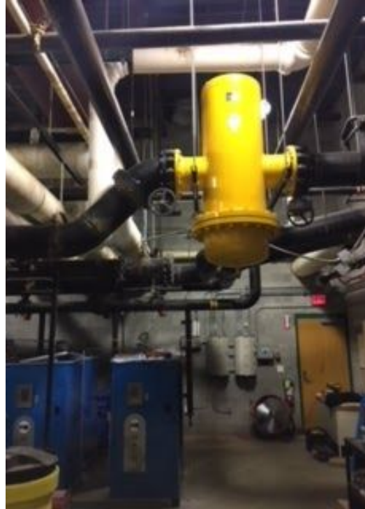
High School - Air and Dirt Separator installed