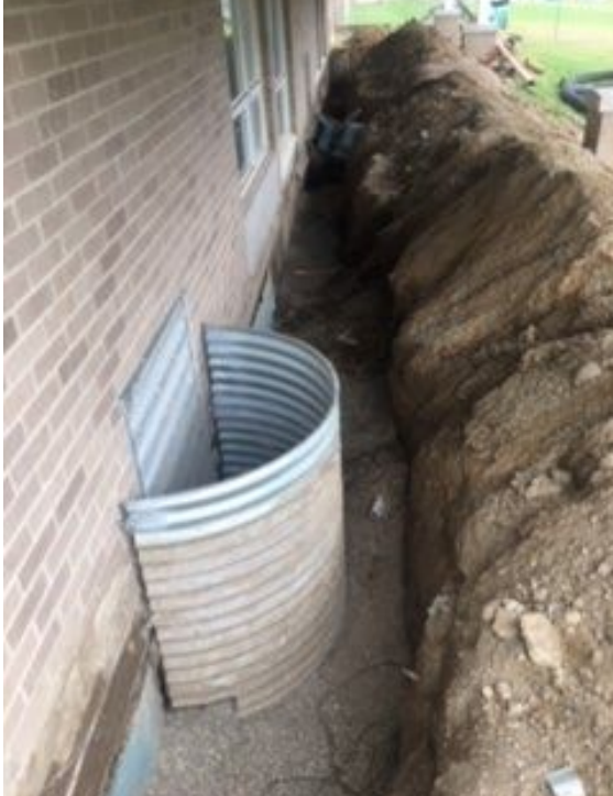
Scripps- Drainage improvement