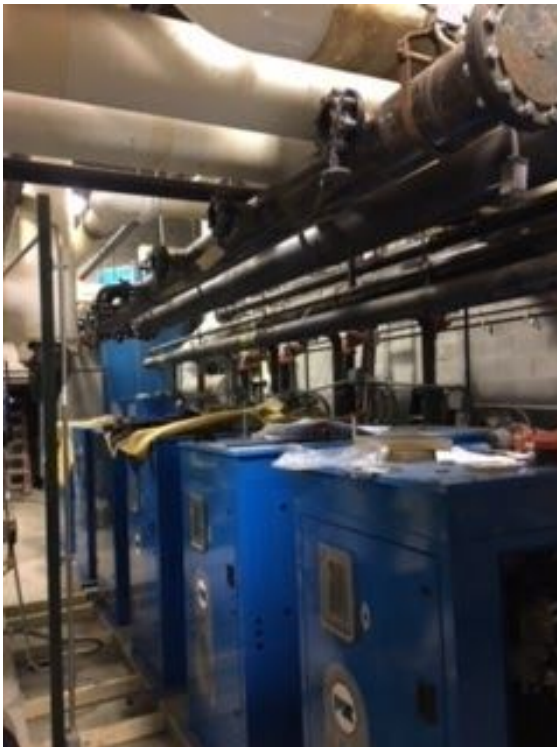
High School- 6 New Boilers in place.