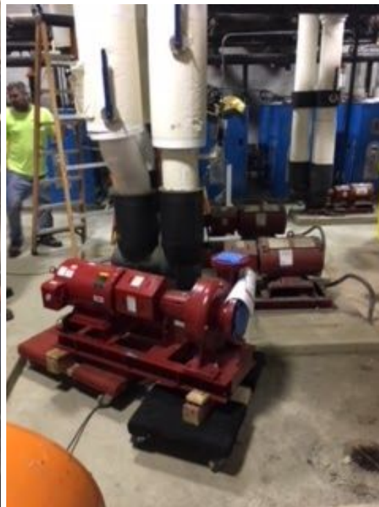
High School- New Secondary Loop Pump