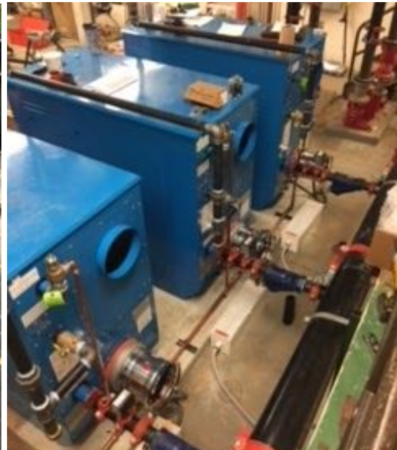
Scripps- Boiler installation