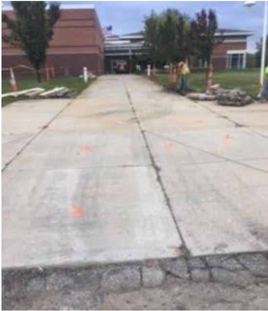
Oakview Middle School- Bus Entrance Concrete