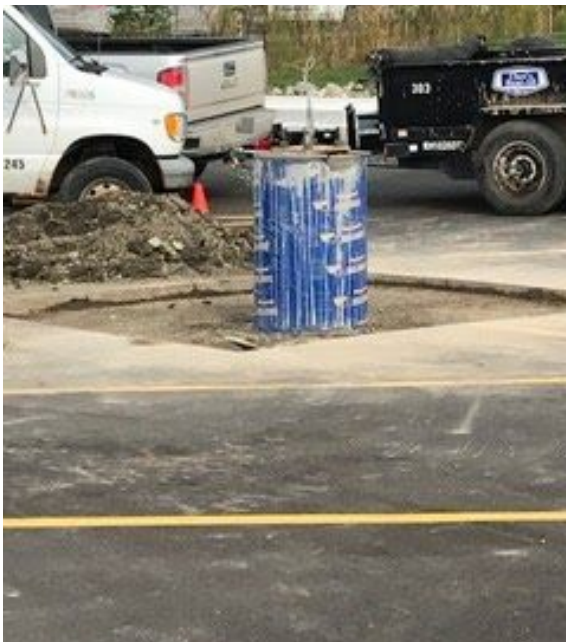
Stadium Drive Ele.- Light Pole Base Replacement