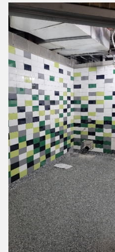
Stadium Drive Bathroom Renovations