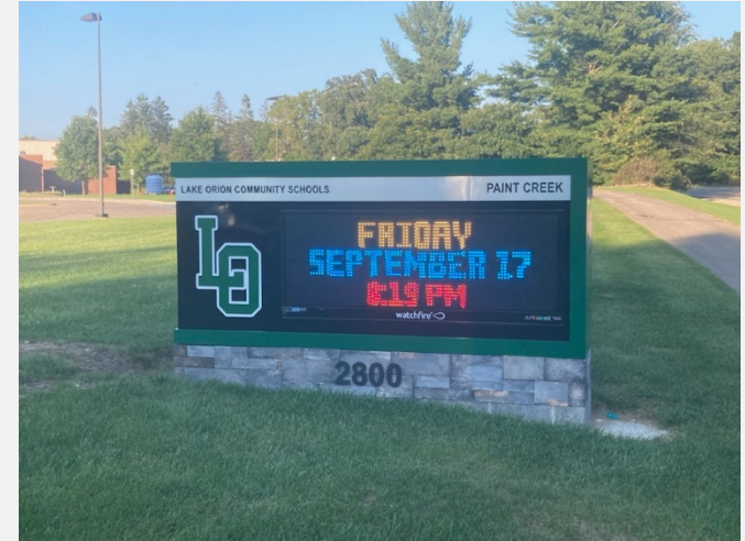
New LED Display Sign at Paint Creek Elementary